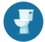
Sharing Toilets, Food, or Drinks