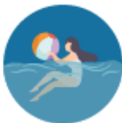
Air or Water