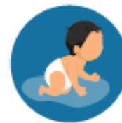
Mother to Baby During Pregnancy, Birth, or Breastfeeding