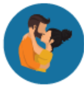
Saliva, Sweat, Tears, or Closed-Mouth Kissing