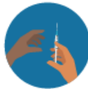
Sharing Needles to Inject Drugs