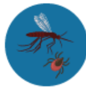
Insects or Pets